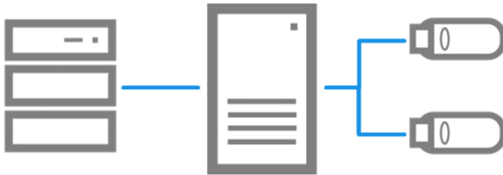
VoiceConsole On Prem Deployment Single Site Architecture

The traditional VoiceConsole On Prem Deployment system architecture (for a single site) looked like this. Honeywell Voice devices connect to a server which is connected to a database.